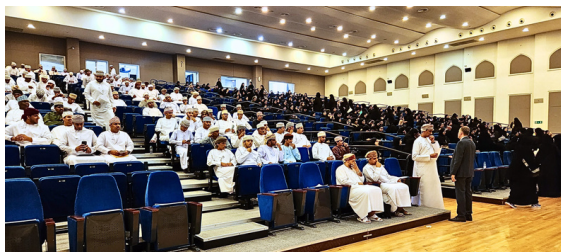
New Student Orientation - September 2023