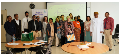
Arabic Class for Non-Native Speakers - June 2023