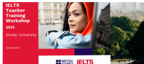
IELTS Teacher Training Workshop - October 2023